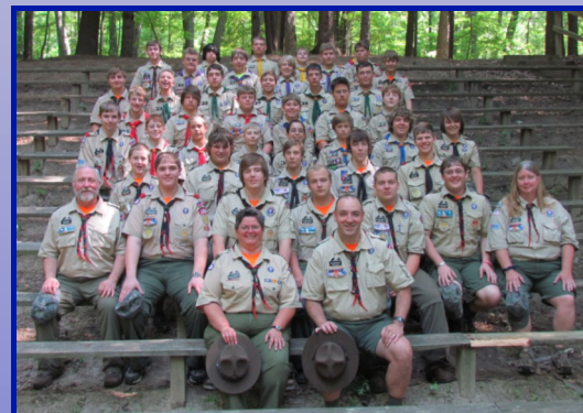
NYLT Class of 2011

Be part of the Most Advanced Youth Leadership Training Course!