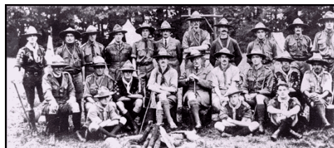
1st Wood Badge Course in 1919 at Gilwell Park in England

All participants must have completed the Basic Leader Training Course for their position in Scouting. Outdoor Skills Training is not required but would be useful. A full Scout uniform will be the dress for the course.